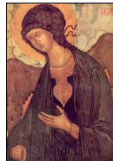
Archangel Gabriel, 15th century.

How does this tie in with the feast of the Heavenly Host? Very directly. If mankind were less attracted to transient earthly ideas, but instead, gazed upward more often, it would notice that even in heaven, among the holy angels, there does not exist the senseless equality over which the godless rave so madly. In the world of the angels, as everywhere in God's creation, there exists a definite hierarchy established by God. This hierarchical subordination and this blessed inequality cement the entire structure. If they were taken out, the structure would collapse.