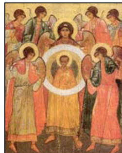
Synaxis of the holy Angels. 15th century. Moscow school.