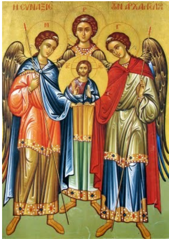
Icon of the Synaxis of the Holy Archangels