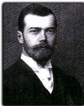
Tsar Martyr Nicholas II