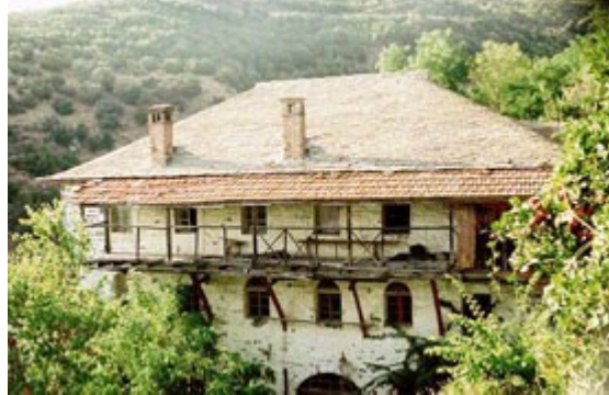
The house in which St Silouan's cell was located

O Lord, grant me tears to shed for myself, and for the whole universe, that the nations may know Thee and live eternally with Thee. O Lord, vouchsafe us the gift of Thy humble Holy Spirit, that we may apprehend Thy glory.