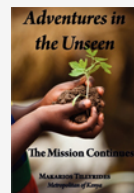
Adventures in the Unseen: The Mission Continues